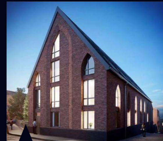
NEW SCHOOL HOUSE Birmingham