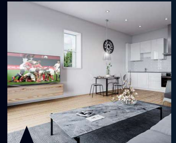
STRATFORD VILLAGE London