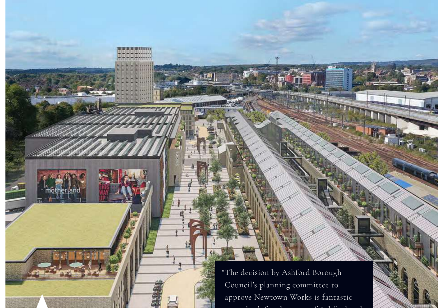
CGI of Ashford International Studios, courtesy of Quinn Estates.

In 2020 planning permission was granted for the ambitious £250m film studio-led regeneration of Newtown Works - a derelict railway works in Ashford.