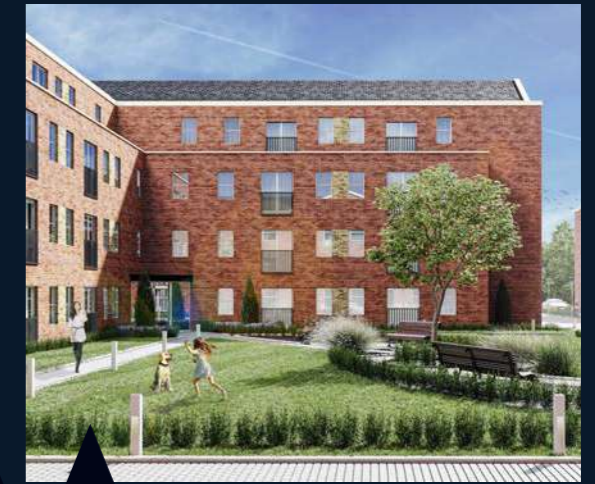
CRESCENT HOUSE Rugby