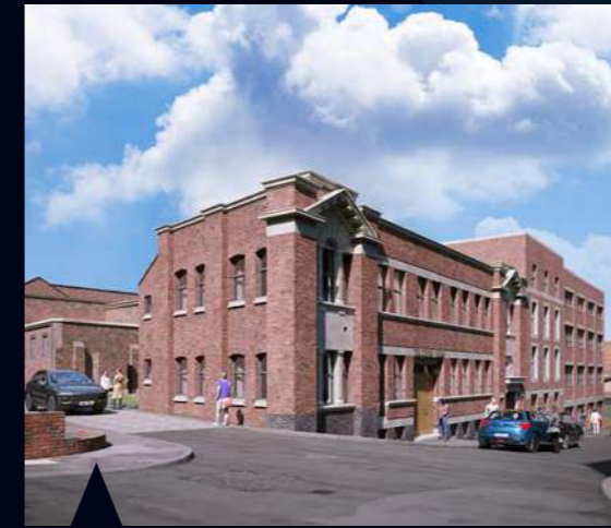
THE COPPERWORKS Birmingham